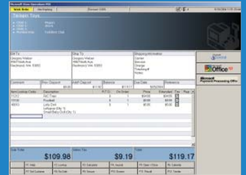
An intuitive point-of-sale screen ensures reduced training time and better productivity.